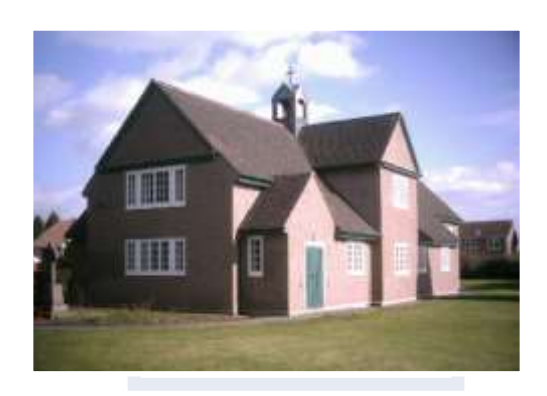
Sunday 18<sup>th</sup> October 2020 19<sup>th</sup> Sunday after Trinity

A very warm welcome to all those joining us in our virtual worship, and in Church at Holy Trinity and St Peter's. It is wonderful we can worship in our various places as part of the body of Christ.